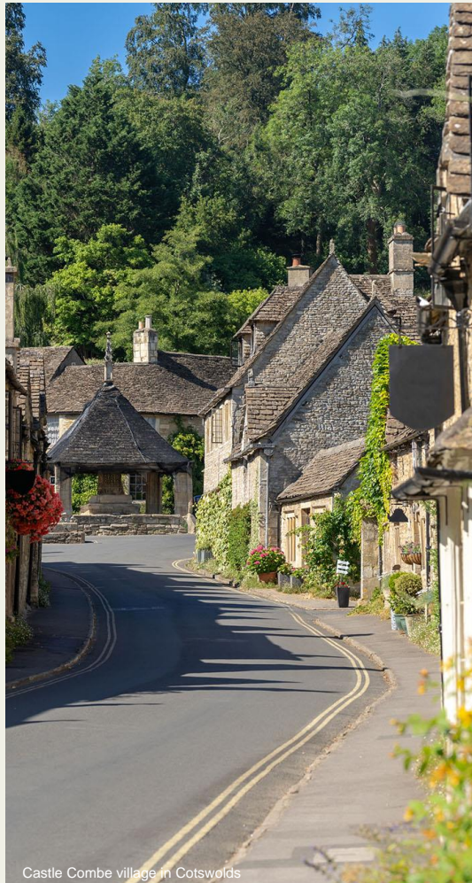
Castle Combe village in Cotswolds