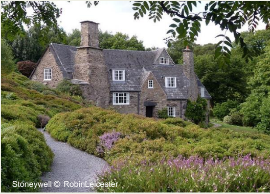
Stoneywell