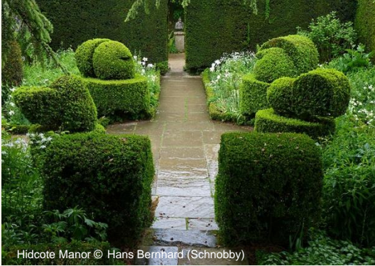
Hidcote Manor