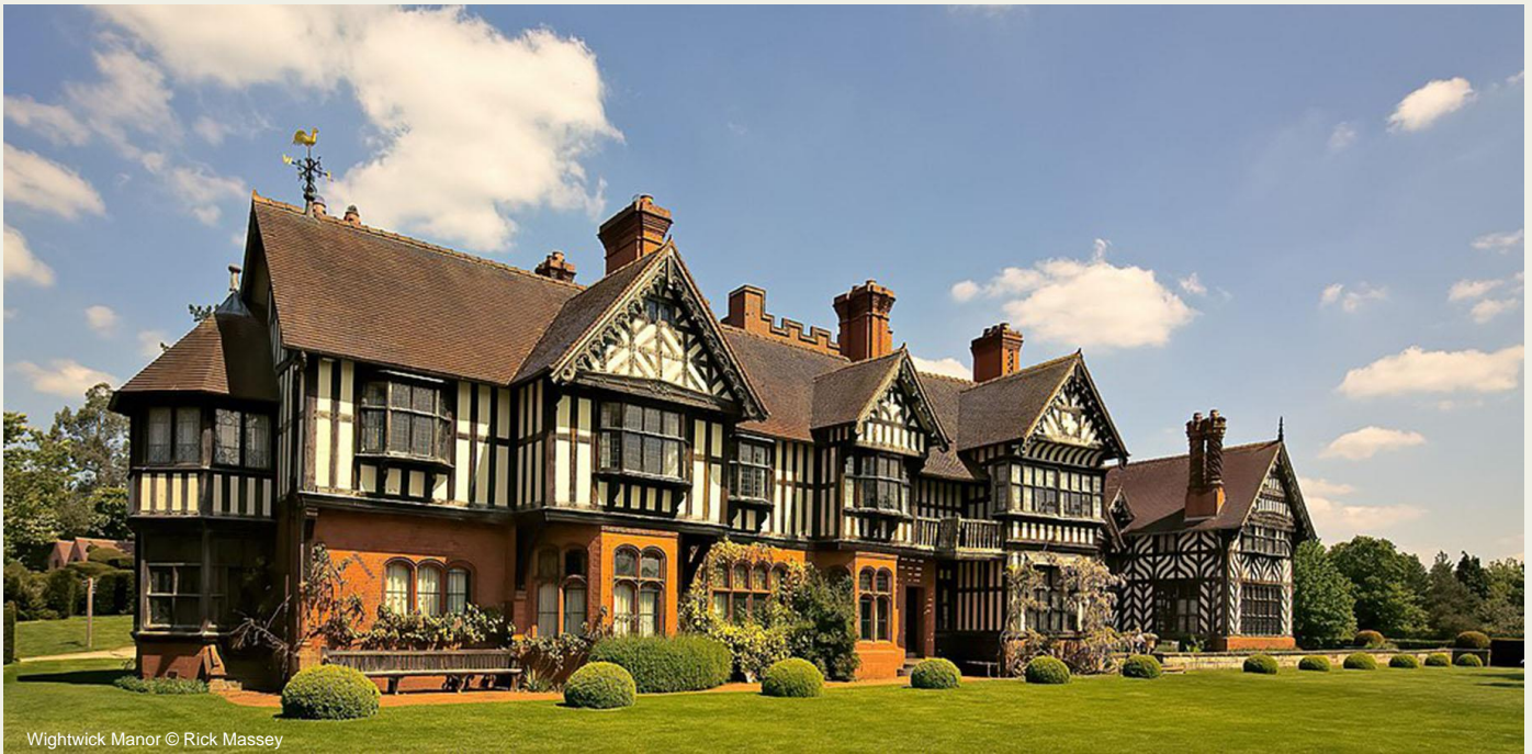
Wightwick Manor