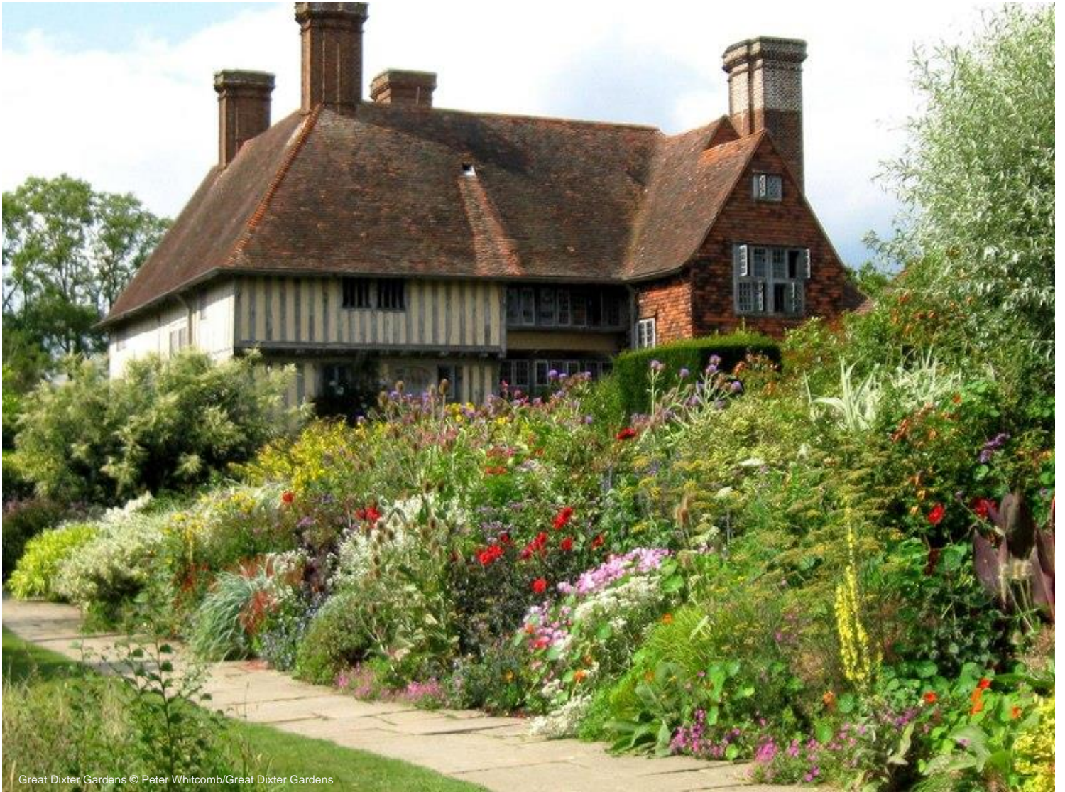
Great Dixter Gardens