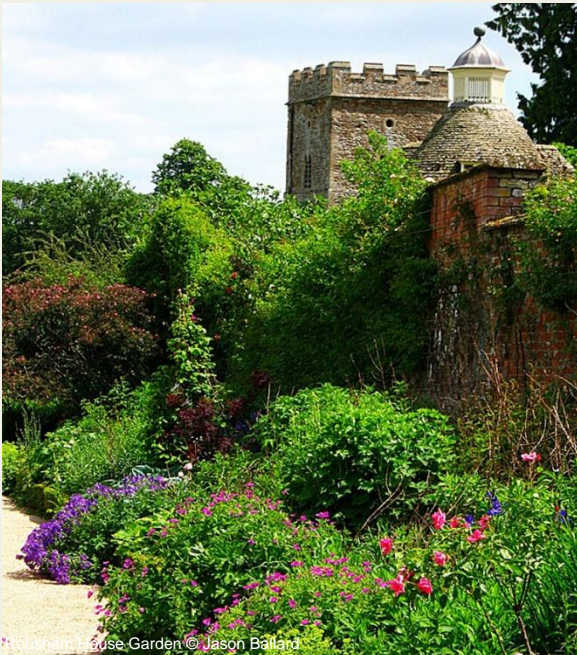
Rougham House Garden