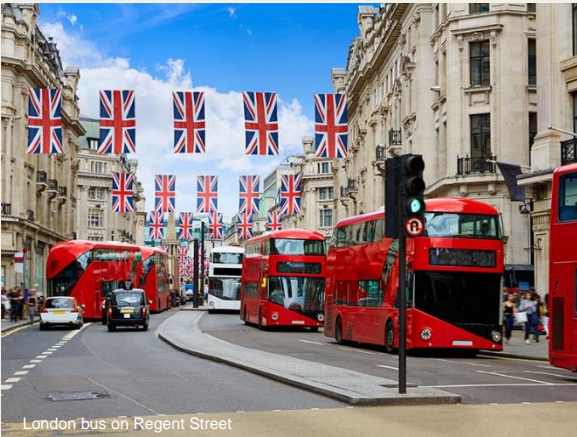
London bus on Regent Street